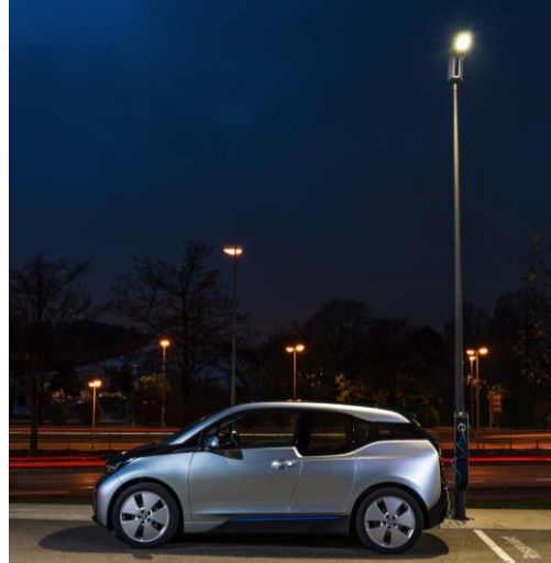
Figure 3: Example EV streetlight charging station by BMW

Demand for EVs is growing faster than the availability of charging stations in many major municipalities. Charging stations can now be added to streetlights, along with associated payment processing, as demonstrated by BMW's "Light & Charge" pilot program in Munich<sup>18</sup>. The pole is fitted with a standardized connector to allow any EV model to charge and an integrated control unit for contactless operation using a smart phone app or RFID card. Not only will this generate revenue for the municipality but it will encourage greater uptake of EVs and support lower carbon emission targets.