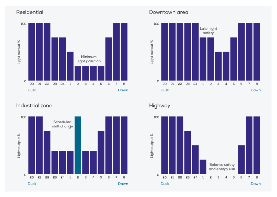
Figure 2: Sample dimming schedules for residential, downtown, industrial and highway areas of a community<sup>5</sup>

To realize the cost savings of a dimming schedule, electricity billing or rate changes will have to be negotiated with the local utility (further discussed in the sections below). If energy monitoring is needed for billing, smart controls with meter grade accuracy may be required.