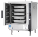
ENERGY STAR® Steam Cookers